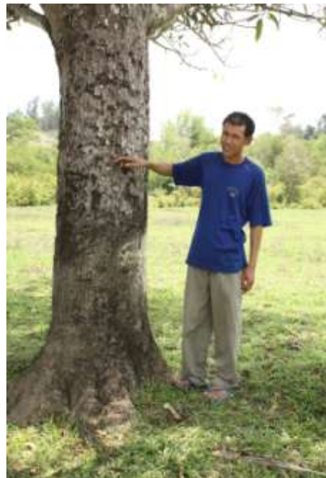
Figure 4: A resident of Xang Village points out how high the water came last year in the middle of his abandoned rice field

Flooding has become increasingly severe as a result of water releases from the dam and increased sedimentation due to erosion. Villagers have experienced recurring losses of wet season rice crops, leading to widespread paddy field abandonment. RMR estimated that at least 820 ha of rice paddy have been abandoned, but no compensation has been paid to villagers (RMR 2006: 2-147). According to villagers we interviewed in Nong Boua Village, people can no longer cultivate wet season rice on 60 ha of paddy land due to serious flooding during the wet season. Today they cultivate 37 ha of paddy land during the dry season (which is less profitable than wet season rice) and have abandoned 23 ha of rice paddy.