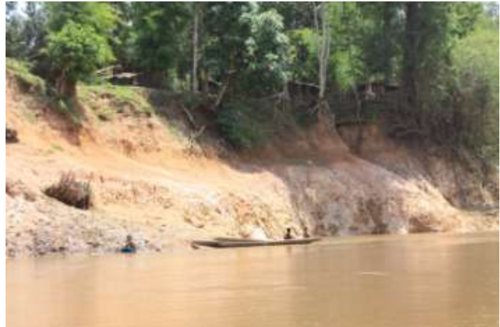
Figure 3: Erosion along the Hinboun River

Research (RMR) – a consulting firm originally contracted to conduct the EIA for the proposed expansion project – estimated that as of 2005, the original Theun-Hinboun project had caused the Hai River channel to widen by about 45m, leading to the loss of around 68ha of land (RMR 2006: 2-24). RMR estimated the value of this land to be between $100,000 and $136,000, but villagers have not received any compensation for these land losses. These impacts have become more and more severe since the project started operating in 1998. During the field visit, the village headman in Thakong Village along the Hai River told us that “erosion of the river is getting more serious and the river is getting wider. Some families lost around one hectare of land along the side of the river. However, only two families in the village received compensation because of erosion.”