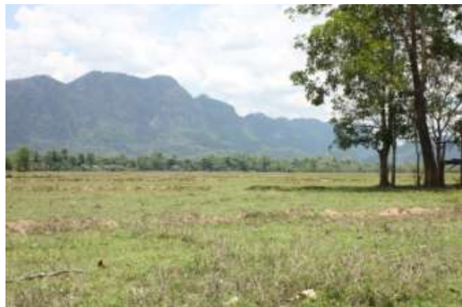
Figure 9: Abandoned paddy fields in Xang village

By their own admission, THPC has had difficulties ensuring the profitability of the dry season rice program due to the high costs of pumping water and of inputs such as fertilizer (THPC 2008, Part 3: 47). 13 Villagers have reported declining yields over the five years since the program was introduced, and a corresponding increase in debt to the village savings and credit funds (FIVAS 2007: 47). The Theun-Hinboun Expansion Project resettlement plan admits that only 872 families were still involved in the program as of 2007, out of approximately 5,000 families living in the downstream areas (THPC 2008, Part 3: 47).