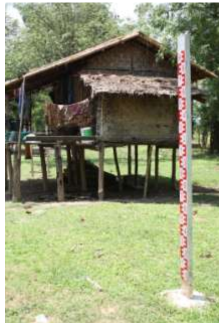
Figure 5: A water gauge set up in Xang Village

Regarding the cost for resettlement entitlements and relocation of affected people, the Decree requires that "Project owners shall prepare the Resettlement Plan with detailed cost estimates for compensation and other resettlement entitlements and relocation of APs" (Article 14, paragraph 1). However, the final Resettlement Action Plan does not include costs for resettlement in the downstream areas. It only includes a budget for infrastructure development and livelihood improvement (THPC 2008, Part3: 71-72).