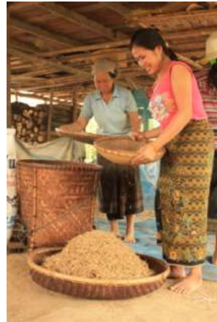
Figure 1: Women in Sopkhom Village

The Theun-Hinboun Expansion Project started construction in 2008 and is expected to be completed in 2011. For the $665 million project, THPC received financing from the Export-Import Bank of Thailand; three international private banks that have signed onto the Equator