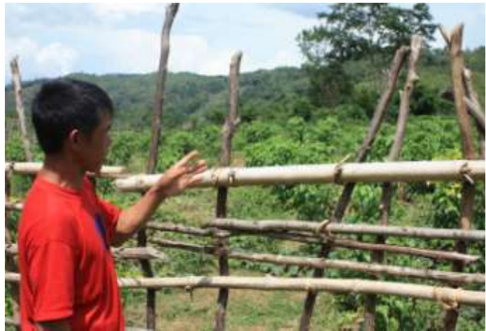
Figure 6: The villager in Sopkhom Village concerning about the compensation for his riverbank garden growing chilies and tobacco

However, villagers in Somboun Village who have lost their entire land holding reported that each family is entitled to only one hectare of farmland in the resettlement area and cash compensation for the remaining lost land. One of our interviewees in Somboun used to have 2-3 ha of land, including 1.8 ha of rice paddy and a vegetable garden. They used to collect bamboo shoots and wild boar from the forest and fish from the river. The village headman in Somboun Village used to have three hectares of rice paddy. His wife reported that “we received only a little bit of money to compensate for our land and the money is not enough to buy new land.” 5