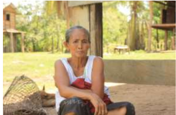
Figure 10: Woman in Kongphat Village concerning about compensations for the displacement.

THPC’s Logical Framework adopted in 2001 to address mitigation and compensation needs included a commitment to conduct independent evaluations and review of the program every two years. The company did conduct an independent review in 2004, but failed to implement any of the review’s recommendations (FIVAS 2007: 7&13). The company did not conduct any additional independent reviews after this time regardless of its commitment. If THPC failed to comply with commitments in the past, what guarantee is there that they will comply in the future? Moreover, in the RAP it is not clear how independent the Panel of Experts for external monitoring will be (THPC 2008, Part: 132). In order to ensure the independence of the Panel of Experts, the company should establish a transparent and accountable process for selecting the members of the Panel, make a commitment to publicly release their reports, and agree to adhere to the Panel’s recommendations. 15