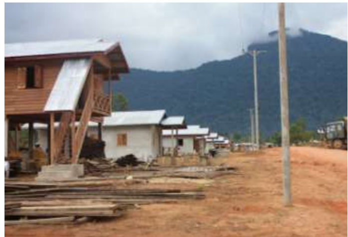
Figure 8: Resettlement site in Nongxong Village

In the CA and RAP, THPC promised to provide displaced persons 440 kg of milled rice per person per year and an additional support of supplementary protein to meet basic nutritional shortfalls during the transition period until livelihood activities provide subsistence requirements. However, the village headman in Phabang Village