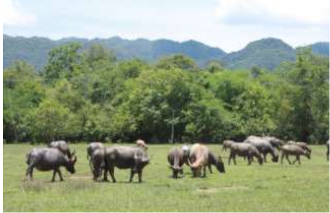
Figure 7: Cows and water buffaloes in Kongphat Village

The village headman in Sopkhom Village has 1.5 ha of rice paddy (enough to feed eleven family members), 0.6 ha of riverbank gardens where he grows chili, and eleven cows grazing in the village. In his riverbank garden, he harvests 1.2 tons of chilies a year, which he can sell for 10,000 kip per kilogram to the market in Lak Sao. He is going to lose all his land due to the project; however, he is having difficulties finding replacement land near the resettlement site where he is supposed to move sometime between 2009 and 2011.