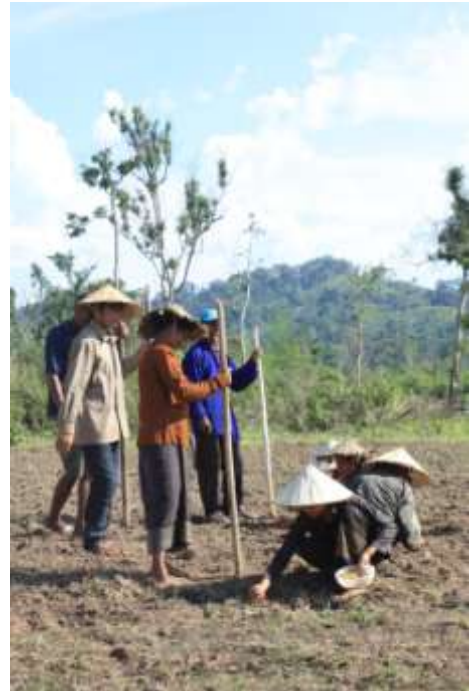
Figure 11: Villagers planting upland rice in the Hinboun Valley. Villagers have had to increase upland rice cultivation due to flooding of rice paddy as a result of the existing project.

9.3 In order to ensure the independence of the Panel of Experts, the company should establish a transparent and accountable process for selecting the Panel members, and commit to implementing the Panel's recommendations.