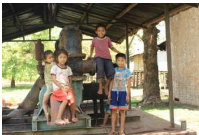
Figure 2: Children playing with an abandoned irrigation pump in Kongphat Village

Fluctuating water levels and stronger flows have caused erosion along the Hai and Hinboun rivers leading to the loss of fertile agricultural land, fruit trees, riverbank gardens and vegetation. Resource Management and